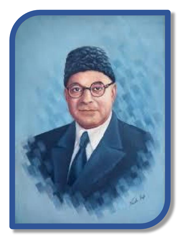
First Prime Minister of Pakistan Shaheed-e-Millat Liaquat Ali Khan